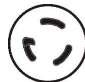
Nema L6-30 Twist