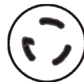
Nema L6-30 Twist